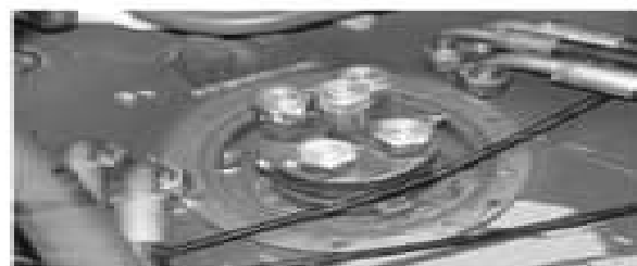
Figure 1 Removal, hydraulic hoses