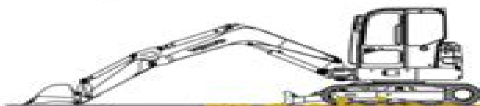
Figure 1 Service position A

Park the machine on a horizontal and firm surface. The suitable position is indicated in the description for the various service jobs.