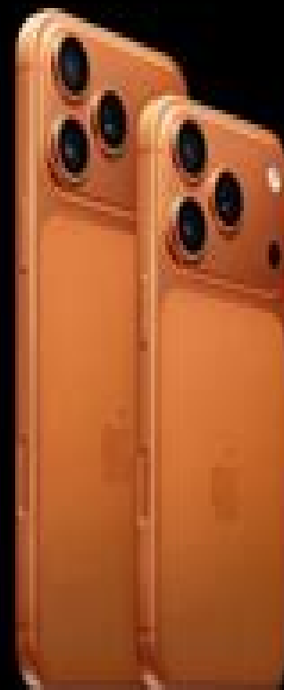
iPhone 17 Pro