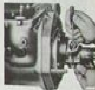
Fig. 3. Removal or Installation of Governor Valve Shaft Snap Ring