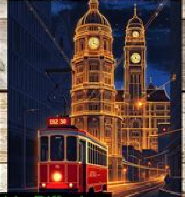
ComfyUI, a node-based GUI for Stable Diffusion.