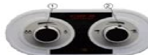
Fig.1- Frente Control