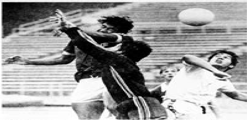
and in the state... (Caption text is partially obscured and difficult to read, but appears to describe the basketball game.)

Moore said Moore Fry is "a very unethical act."