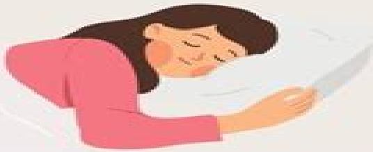
wake up mindfully