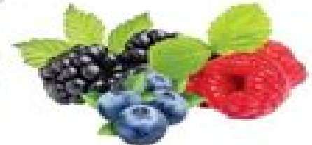
Berries 1/2 cup