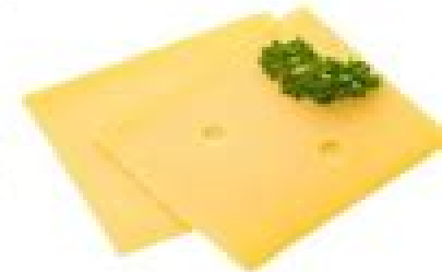
Cheese Slice 1 count