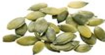
Pumpkin Seeds 1 TSP