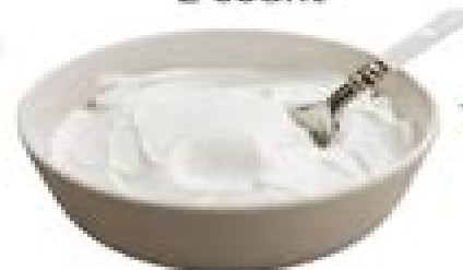
Greek Yogurt 1 cup