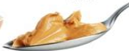
peanut butter 1 tbsp