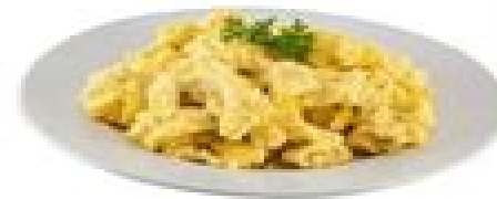
Scrambled Eggs 2 count