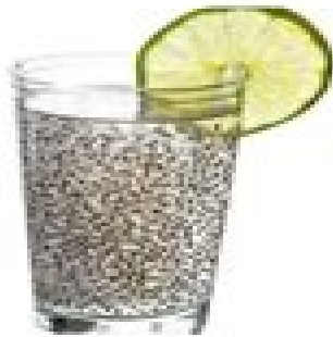
Chia Seeds Water