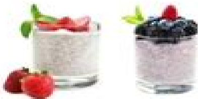
Chia Seeds Pudding