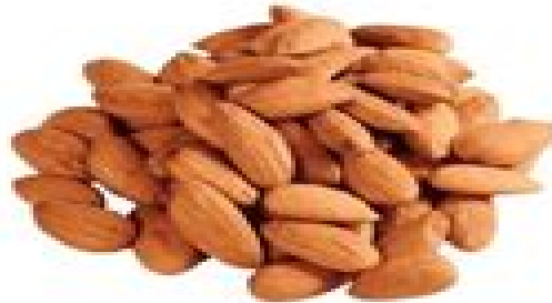
Almonds 10 count