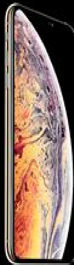
iPhone X (Max)