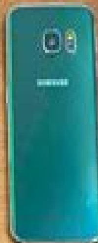
Galaxy S6 edge+