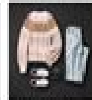
Try before you buy