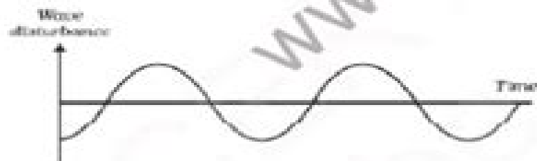
Wave shape for a low pitched sound

High and low pitched sounds are called treble and bass respectively.