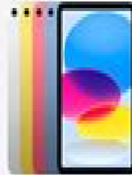
iPad (10th generation)