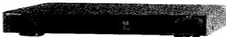
This photo is SLV-676UC

• Refer to the SERVICE MANUAL of VHS MECHANICAL ADJUSTMENTS II for MECHANICAL ADJUSTMENTS. (9-972-816-11)