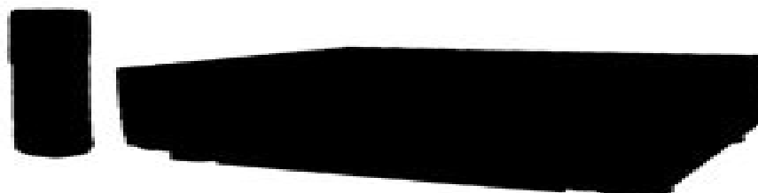
Photo : DHR-1000VC : RMT-X1000B

AEP Model DHR-1000NP/VC UK Model DHR-1000UX French Model DHR-1000B