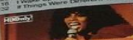
HBO Rocks Donna Summer