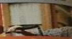
Trail of the Pony