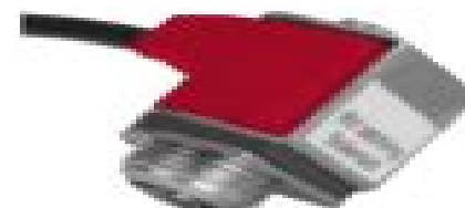
Toro latching solenoid