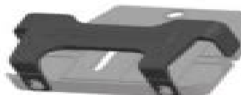
DDCWP Custom Mounting Bracket