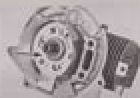
Figure 10 Actuator Bearing Assembly

STEP 41 Remove the Actuator Bearing Assembly (Fig. 10).