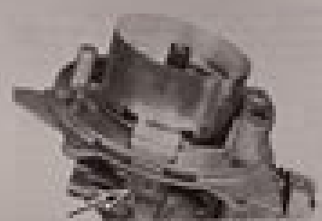
Figure 13 Correct Actuator Arm Location

STEP 45 Install the Actuator Bearing & Retainer Assembly and the Brake Plate.