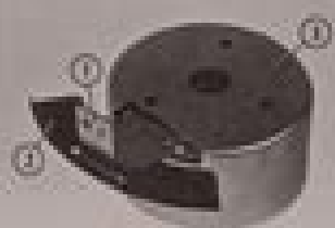
Figure 12 Clutch/Brake Unit Pre-assembly

STEP 43 Pre-assemble the Actuator & Arm into the Clutch/Brake Housing. Then position the Actuator Shaft into the Arm as shown in Fig. 10.