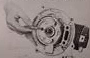
Figure 15 Shoulder Screws & Spring Installation

STEP 46 Install the 2 Shoulder Screws and Pressure Springs. Tighten to 15 ft. lbs. (140 in. lbs.).