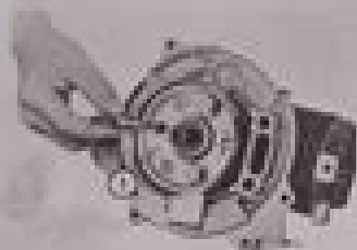
Figure 9 Shoulder Screws & Spring Removal 1. Brake Plate

STEP 40 Remove the 2 Shoulder Screws and Pressure Springs. Then remove the Brake Plate (Fig. 14).