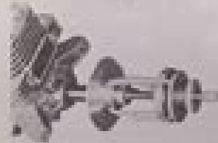
Figure 8 Recommended Roller Assembly

NOTE: If the Clutch/Brake Assembly is installed during assembly with a roller pin and chain as shown in Fig. 10, the roller pin is not required.