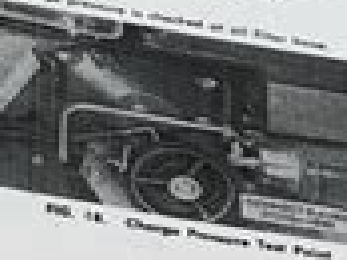
FIG. 18. Change Pressure Test Point