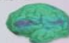
Brain after 5 Years