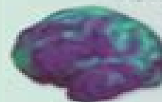
Frontal of Brain