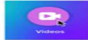
Canva Bkgnd. Remover