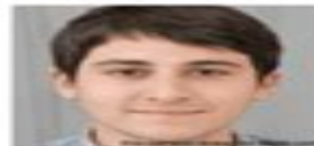
Random Face Generator