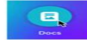
Canva Magic Write