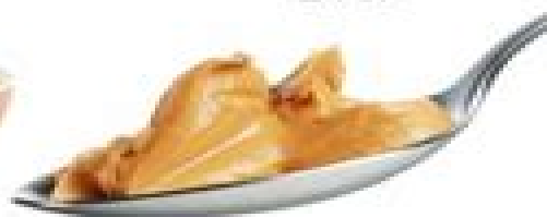
peanut butter 1 tbsp