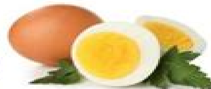
Boiled Eggs 2 count