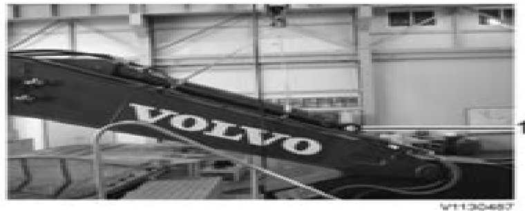
Figure 3750 Arm cylinder rod, retraction 1. Arm cylinder rod