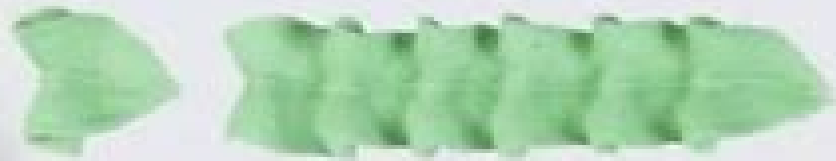
Leaf Border/Borde de hojas/Bordure de feuilles Tip/Boquilla/Douille: 70