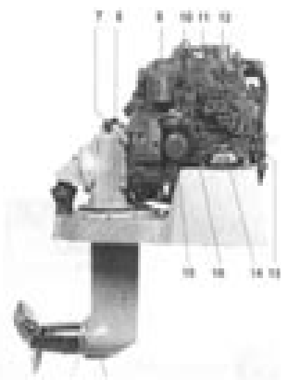
MD2010AB & MD2010B