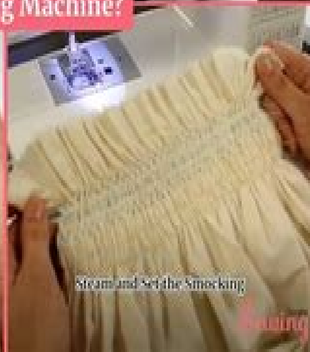
Steam and Set the Smocking