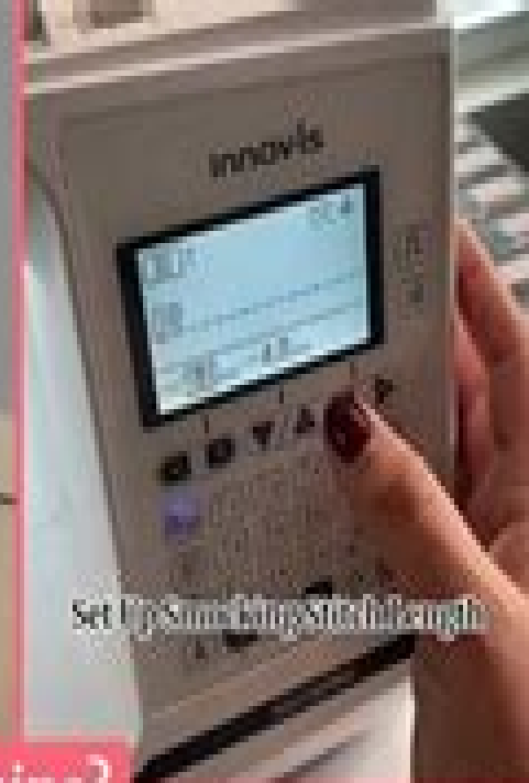
Set Up Smocking Stitch Length