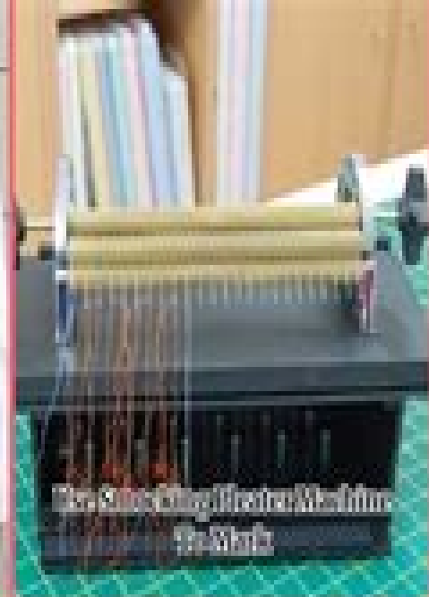
How Smocking Effect Works To Sew