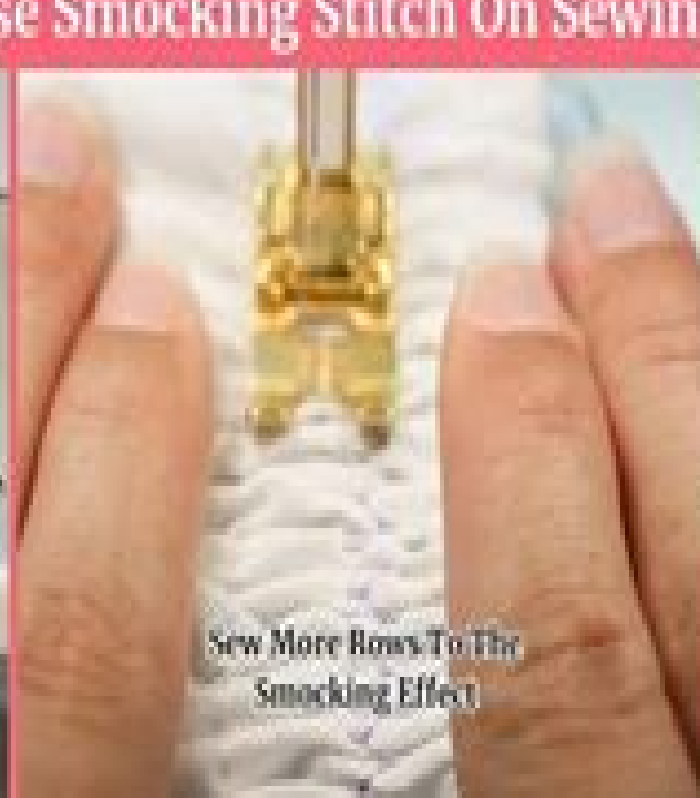
Sew More Rows To The Smocking Effect