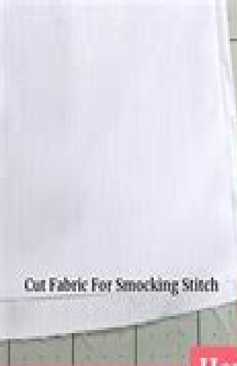
Cut Fabric For Smocking Stitch