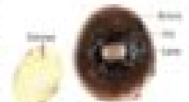
Front view of anterior half of cow eye with cornea removed.