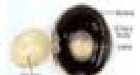
Back view of anterior half of cow eye with cornea removed.