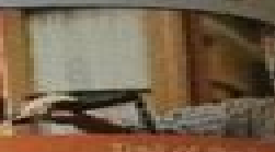
Trail of the Fox