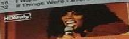
HBO Rocks Donna Summer