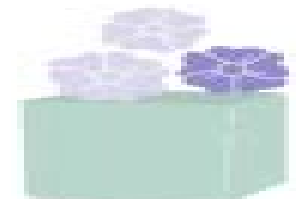
Square or Cube Vase