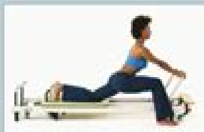
Single Leg Stretch