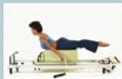
Arms Pulling Straps