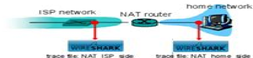
Figure 1: NAT trace collection scenario

Figure 1 shows our Wireshark trace-collection scenario. As in our other Wireshark labs, we collect a Wireshark trace on the client PC in our home network. This file is called NAT_home_side 2 . Because we are also interested in the packets being sent by the NAT router into the ISP, we'll collect a second trace file at a PC (not shown) tapping into the link from the home router into the ISP network, as shown in Figure 1. (The hub device