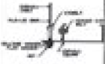
CORNER JOINT DETAIL FOR CORNER JOINTS & TRIM