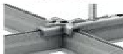
Hanging & Field Connector at splice