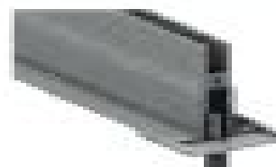
Duo Anti-slip Nibbler (used for suspending cabs from 1/2" x 1/2")