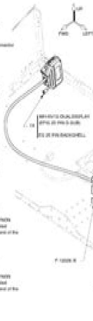
FIGURE 1: EPS WIND HARNESS INSTALLATION (SEE PARTS AND COMPONENTS LISTED AND CLARIF)