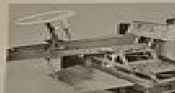
Controls and steering are simple. The Super Pro is built for long life and low maintenance.