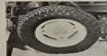
The Super Pro has a wide wheelbase, strong body, and a heavy-duty deck.