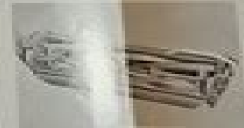
The Super Pro has a wide wheelbase, strong body, and a heavy-duty deck.