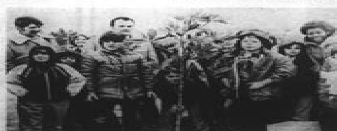
Arbor Day Observed

The following information will be available at the Thursday, February 15th Sagehen Park Community Center (7:00 p.m. to 9:00 p.m.) at the Community Center. The information will be available at the center and will be for the use of the center. The information will be available at the center and will be for the use of the center. The information will be available at the center and will be for the use of the center.