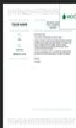
Creative cover letter, designed by MOO