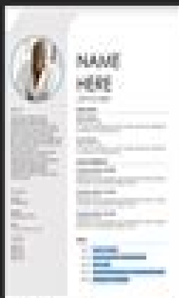
Bold modern resume