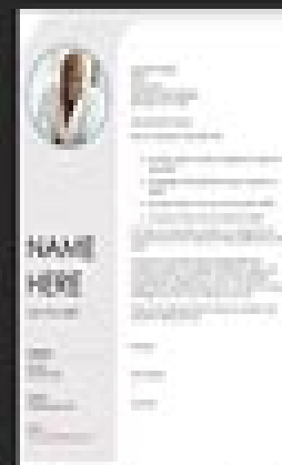
Bold modern cover letter