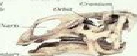
SKULL OF BRACHYLOPHOSAURUS