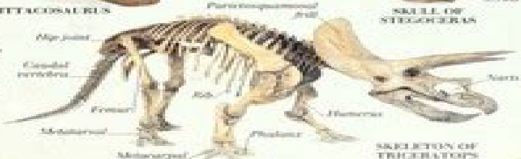
SKULL OF TRICERATOPS