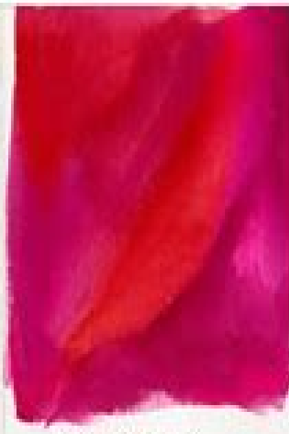
WET ON DRY