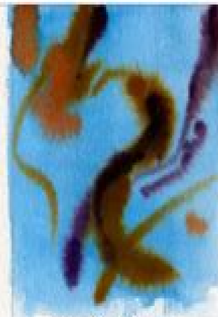
DRY ON WET