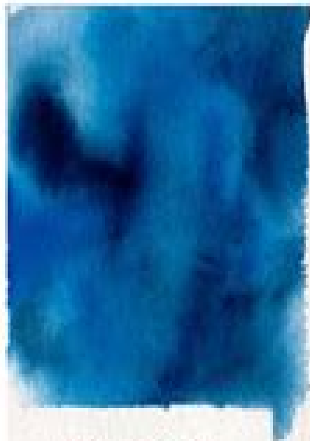
WET INTO WET