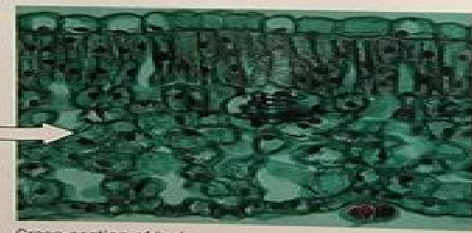
Cross-section of leaf