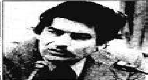
Minister van Arbeid, J. van den Broek

De Nederlandse werkgeversverenigingen hebben de strijd tegen de loonstijgingen in de industrie hardop aangekondigd. Ze willen de loonstijgingen beperken tot maximaal 5 procent. Dit is een harde lijn, want de vakbonden willen een stijging van 10 tot 15 procent.