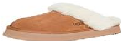
6. UGG SHEARLING SLIPPERS