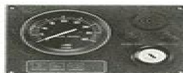
Instrument panel with tachometer and alarm display for oil pressure, coolant temperature, and charging.