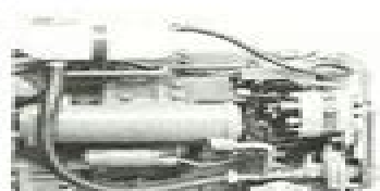
Freshwater cooling extends engine service life, reduces the risk of corrosion and also provides for a hot water outlet.