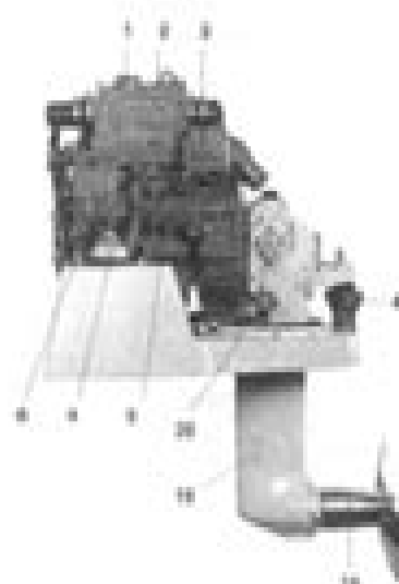
MD2010AB & MD20