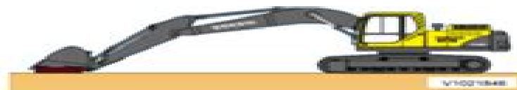
Figure 1325 Machine position

Refer to the "Operation of accumulator in emergency" in the "Handling accumulator" section of the Operator's manual.