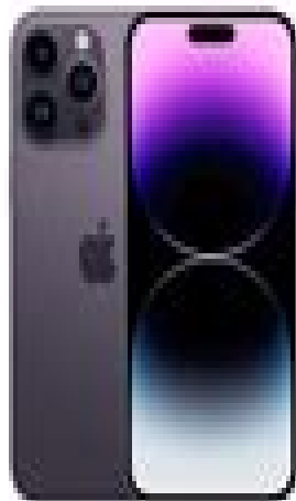
iPhone 14 Pro Max