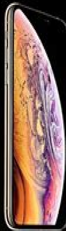
iPhone XS ®