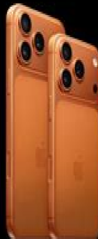
iPhone 17 Pro