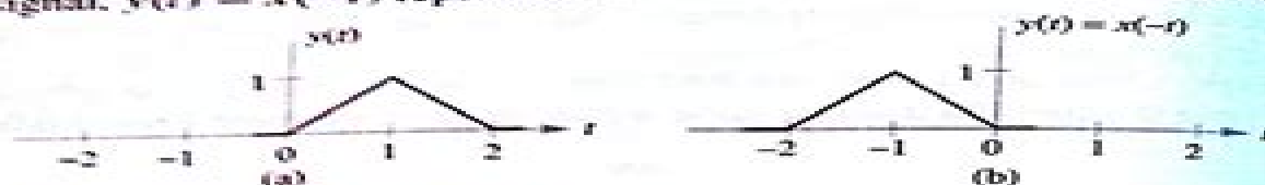
Fig. 1.11 (a) Triangular pulse, x(t) and (b) Reflection of x(t) about vertical axis.

Let x(t) denote a continuous-time signal. The reflected version of x(t) is obtained by replacing with -t . The signal, y(t) = x(-t) represents a reflected version of x(t) about the vertical axis.